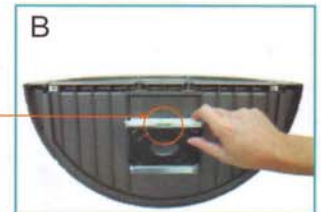
B Remove the mounting bracket.