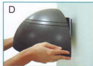
D Lift the fixture up and tilt slightly toward the wall mounted bracket as figure D shown, hook the fixture base plate with the mounting bracket.