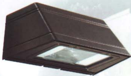
SM301 (Trapezoid Shape)