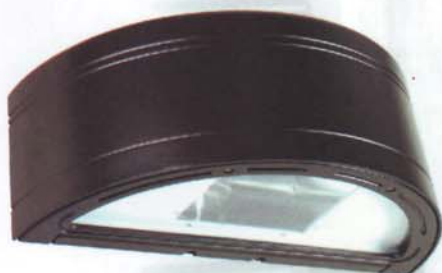
SM302 (Half Moon Shape)