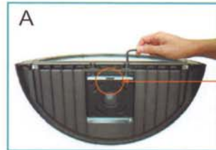
A Uninstall the mounting bracket from fixture base plate by unscrewing the 2 hex socket studs.

Unlike other fixtures which require more than two people to install, our IMB (Intelligence Mounting Bracket) helps you to save time and money. With its light, small and user friendly bracket, you can install this fixture easily with only one person in a much shorter time. Meanwhile, you can check the leveling by using the integrated level bubble on the mounting bracket. In this competitive industry, we understand the importance of saving you labor cost and time. A smart tip!