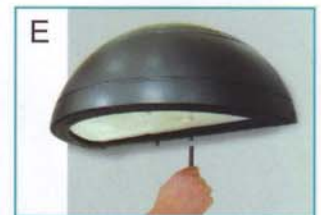
E Screw tight the bracket and fixture.